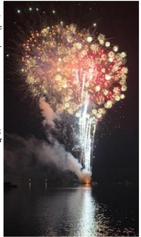
Fireworks donors, page 7